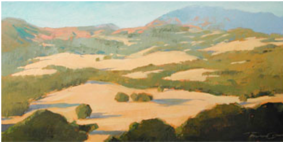
A July Day oil on canvas 12" x 24"